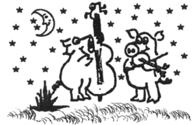
30 stars for 30 years!