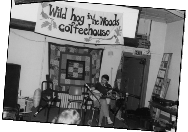
Top two photos: Jamming and planning the future Wild Hog Remaining four photos: At the Wild Hog, 604 University Avenue, circa 1978/9