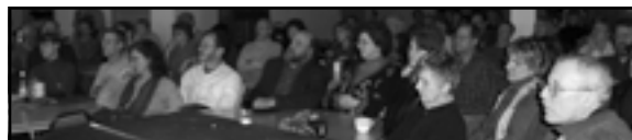
Audience at the Coffeehouse